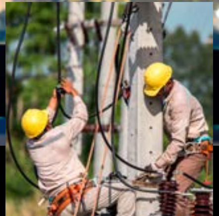
Human error accounts for the majority of annual outage events.