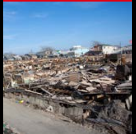
Natural disasters can interrupt primary connectivity in an instant.